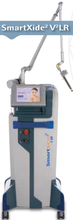
SmartXide 2 V 2 LR